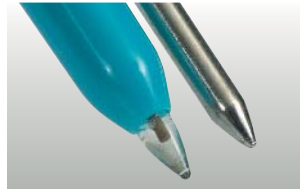
testo 206-pH2: pH2 probe head for semi-solid food

Ideal for the testing and care of water-based coolant-lubricants (according to BGR 143).