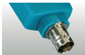
testo 206-pH3: pH3 probe head with BNC interface