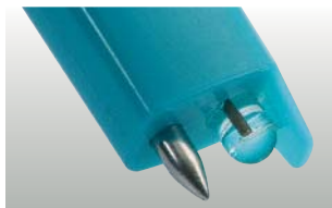
testo 206-pH1: pH1 probe head for liquids