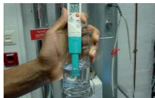
Ideally suitable for monitoring heating system water according to VDI 2035.