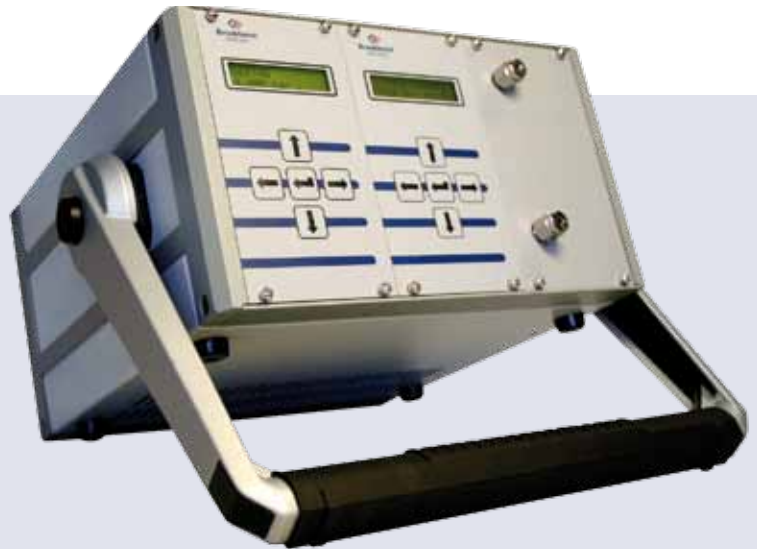
Dosing unit for flowranges up to 4000 g/h, max. 5 barg (based on water @ 1 bara, 20 °C)