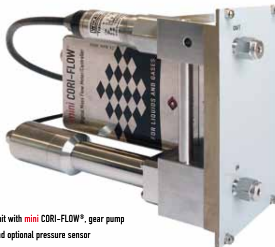
Unit with mini CORI-FLOW® gear pump and optional pressure sensor